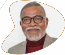
Dr. Narendra Jadhav

Hon. Member of Parliament, Rajya Sabha, Former Member of Planning Commission